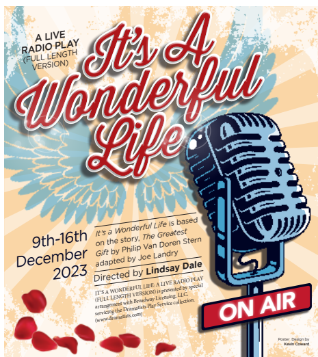
It's A Wonderful Life (Classic fantasy) 9th-16th December, 2023