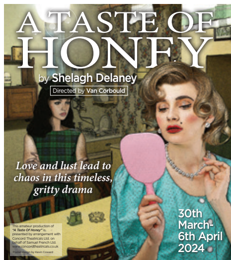
A Taste of Honey (Drama) 30th March - 6th April, 2024