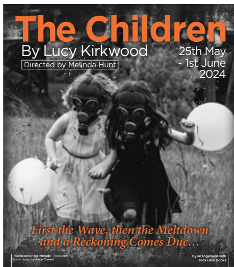
The Children (Environmental thriller) 25th May - 1st June, 2024