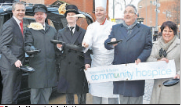
Pancake flippers train for the big race

Media House | 539 High Road | Ilford | Essex | IG1 1UD